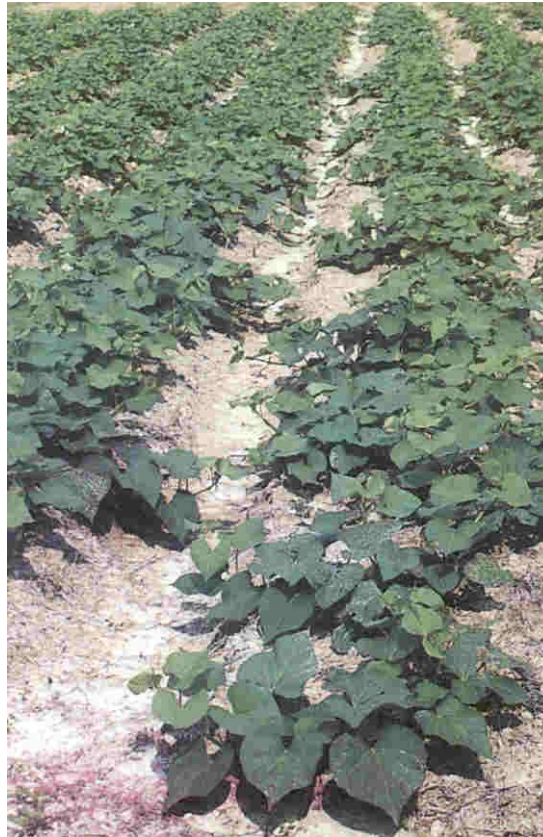
Established Sweet Potato Field